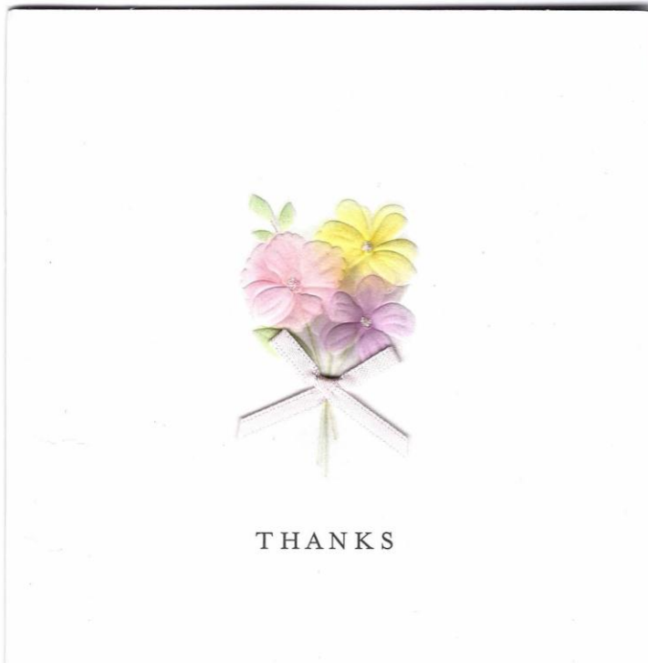
Front of the Card